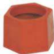
HGS - E - P6