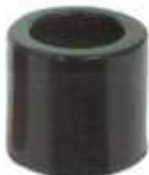
HGS - E - P0