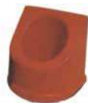
HGS - E - P61