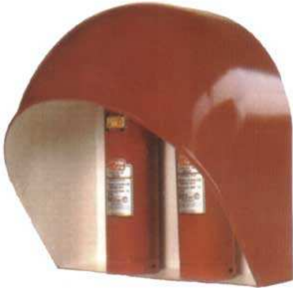
Abrigo para extintor individual