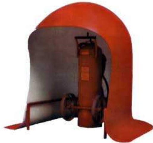
Abrigo para extintor de Carrinho